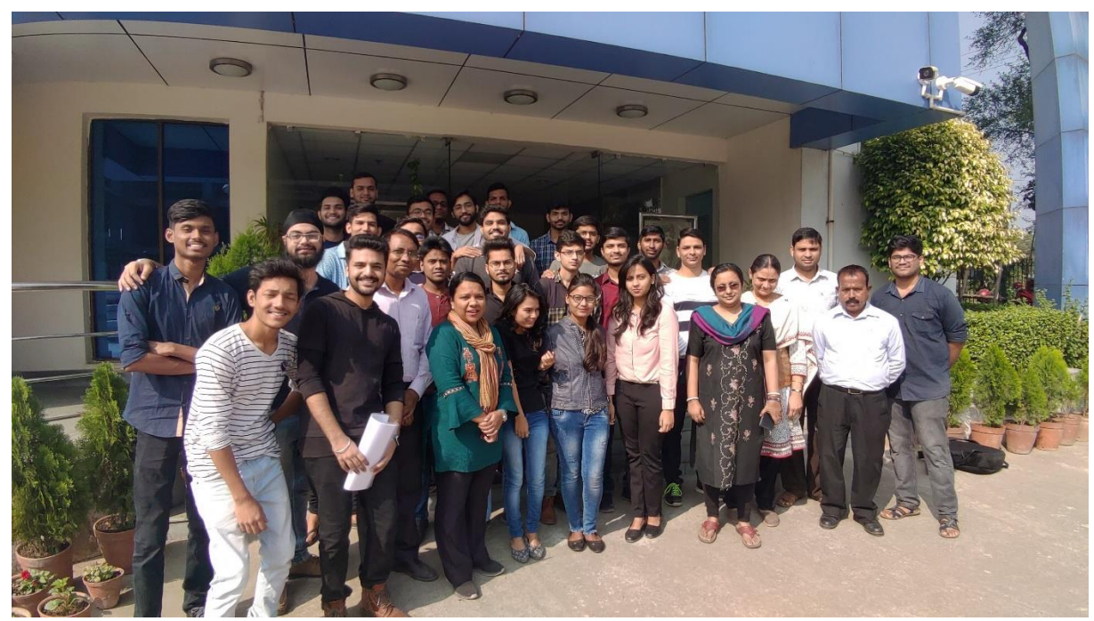
Photograph: Students of Final year (Batch 2016-20) with Faculty members.