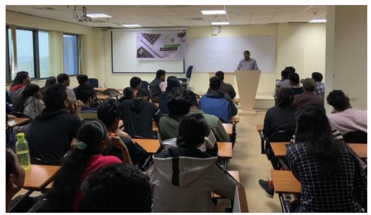
Photograph: During the preparatory SIH 2020