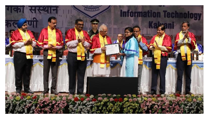
Photographs: Award and Prize winners of Batch 2015-19.