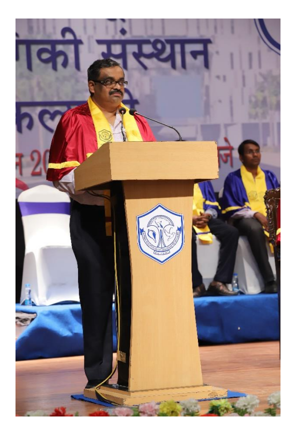
Photograph: Director's Address to the Students and Audience