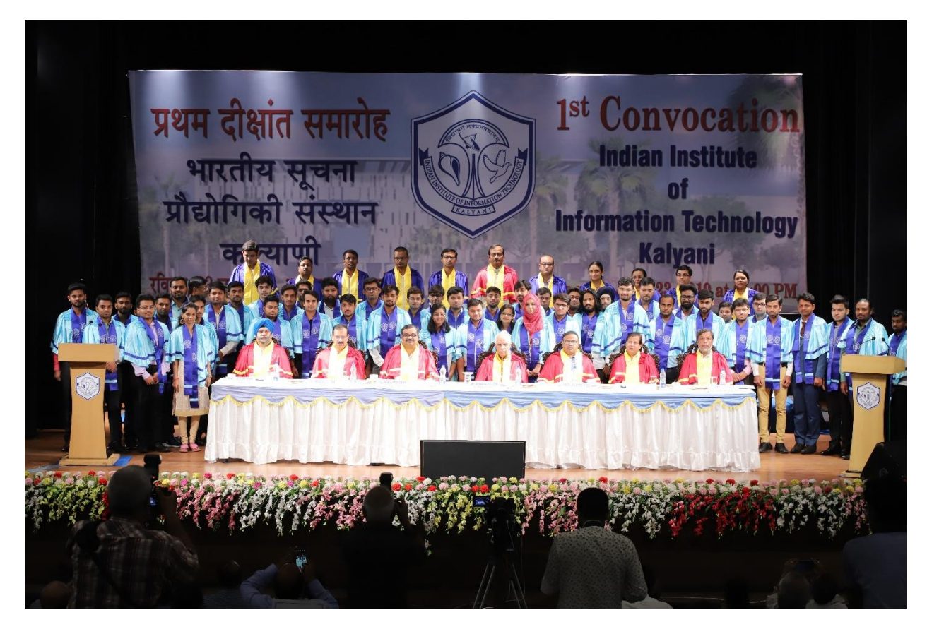
Photograph: All Students who received degrees with the dignitaries on the dais.