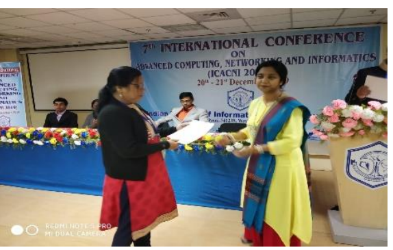
Photographs: A few moments from the Conference.