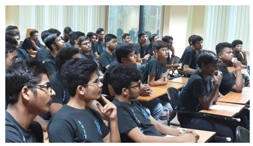
Photograph: New students of the year 2019.