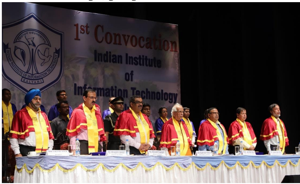
Photograph: Dignitaries on the Dias