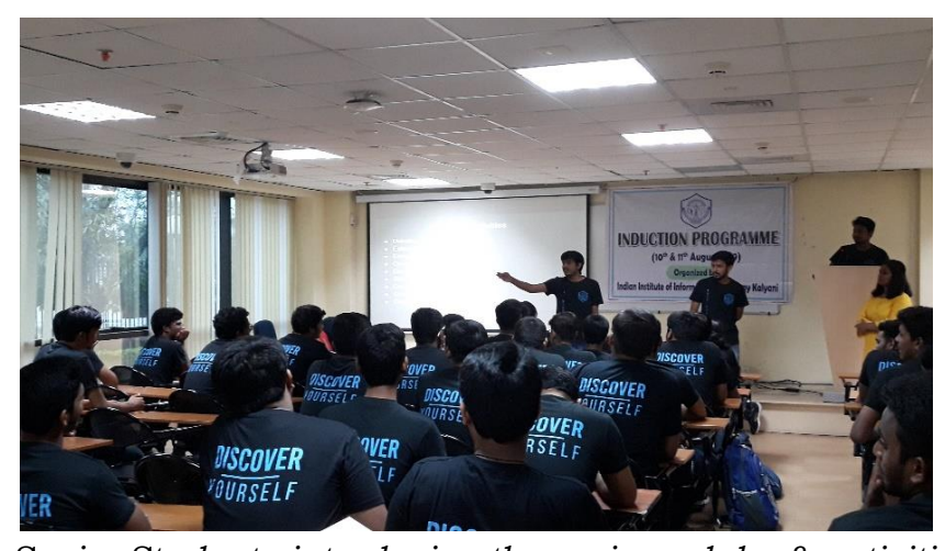
Photograph: Senior Students introducing the various clubs & activities to freshers.