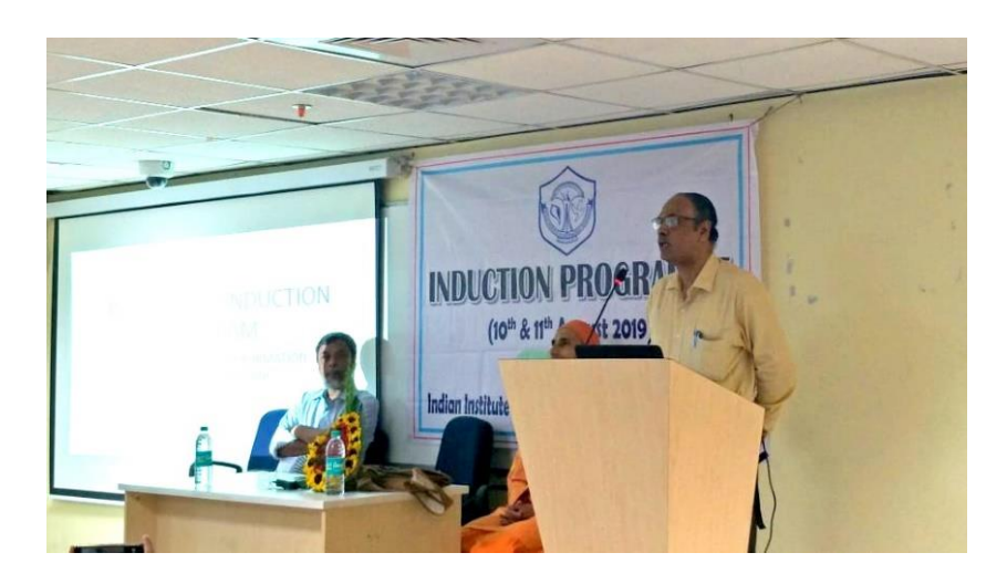
Photograph: Director's address to students during induction program.