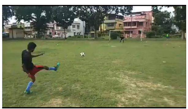
Photograph: Students playing indoor and Outdoor games at Kalyani Stadium