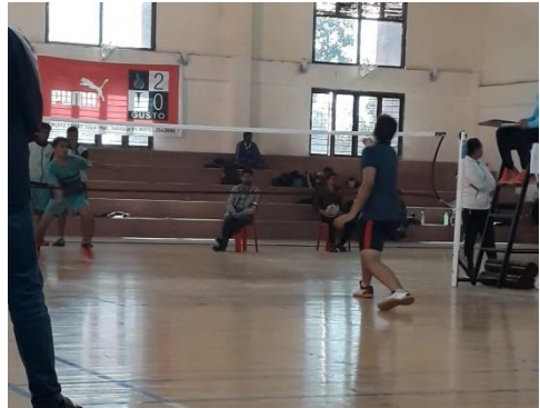
Photographs: IIIT Kalyani participated in Cricket, Carroms, Badminton and Table Tennis at the Inter IIIT Sports Meet 2020.