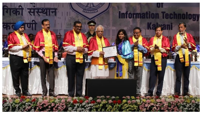
Photographs: Award and Prize winners of Batch 2014-18.