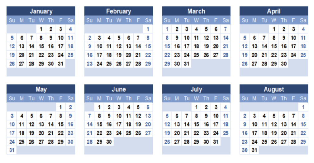
*Due to the COVID Pandemic, all classes were suspended from 14th March 2020.