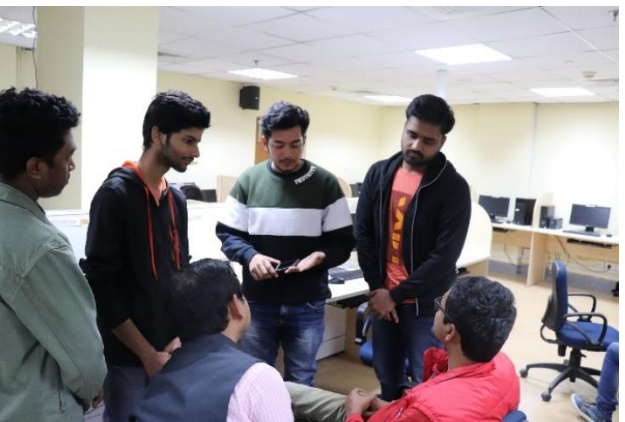
Photographs: Teams for the preparatory SIH 2020.