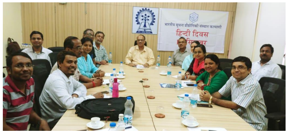
Photograph: Director's Meeting with Faculty and Staff at IIT Kharagpur Salt Lake extension Centre on the occasion of Hindi Diwas